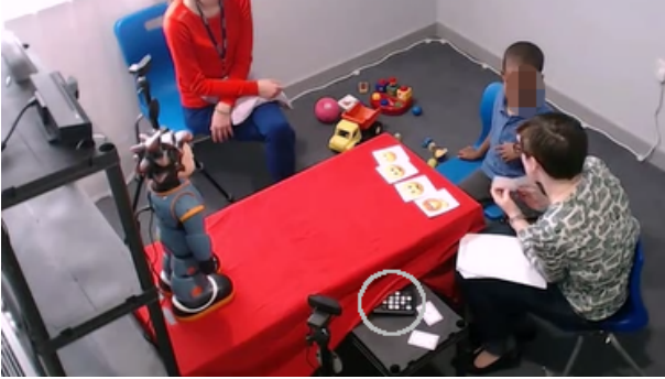
Figure 2: Child participating in the U.K. DE-ENIGMA experiment. Figure shows child identifying the emotion of Zeno-R25 (DE-ENIGMA humanoid robot) with CRAE researcher. School staff member (in red), accompanying the child during the session. Circled is the Wizard-of-Oz keypad interface used to control the Zeno robot.