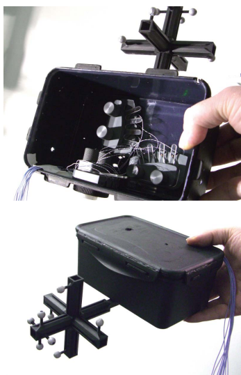
Figure 1: The container with the EMA sensors and OPT markers.

In the current study, the task appears to be relatively simple, a non-linear regression requiring only a mapping from a six-dimensional input space to a five-dimensional output space. By ignoring the orientation angles, which are seldom used in speech research, the output space even reduces to three dimension. However, due to the complexity of the electromagnetic field and in particular the impact of orientation angle changes, the mapping is far from being an easy inverse problem. In addition, it is difficult to acquire a data set that approximately equally samples the entire output space, because the sensors have to be physically moved and not only the EMA measurements have to be acquired but also some kind of ground truth. Accordingly the (deep) neural net has to learn from an incomplete and potentially biased data set.