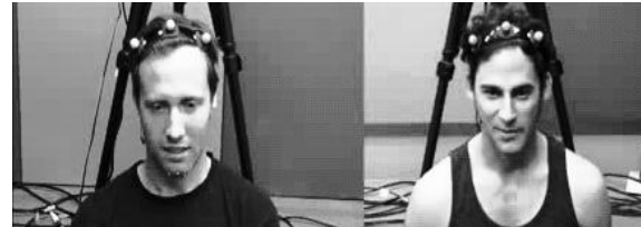
Figure 1: Combined videos of talkers A and B of Pair01.

capture system and joined in a single video that displayed both talkers along-side each other (see Figure 1). Then we performed text level transcription of inter-pausal units on the audio and also annotated non-verbal gestures such as audible breathing, smacks and laughter using the Praat TextGrid editor [11]. Based on these transcriptions we performed an analysis of talkers' contributions to the dialog in order to investigate whether the task was balanced.