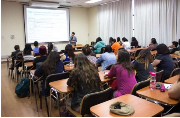
Lecture given at USACH